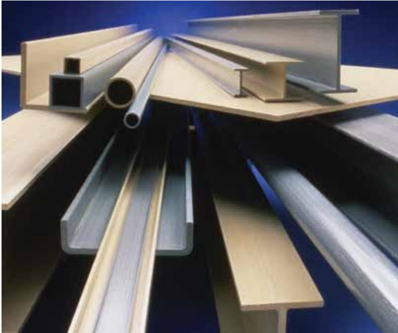
EXTREN® fiberglass structural shapes and plate