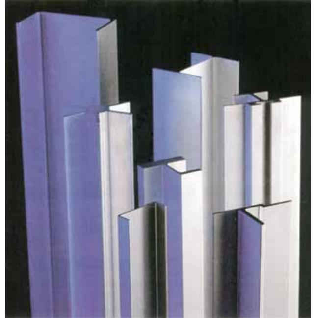
Typical aluminum shapes extruded from aluminum billets